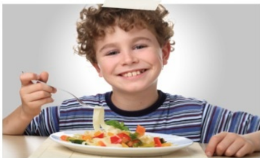
tā chī fàn 他吃饭。